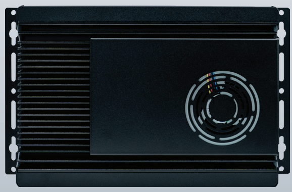
IBX440 top view